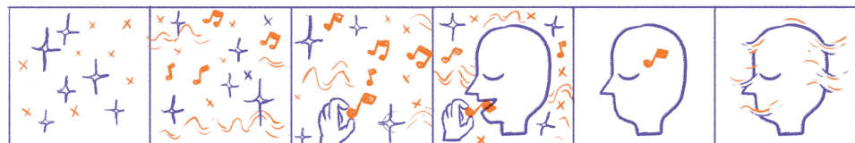
Frequency Comic: Soma Sebesvari

Follow us for updates: https://www.facebook.com/OzorianProphet