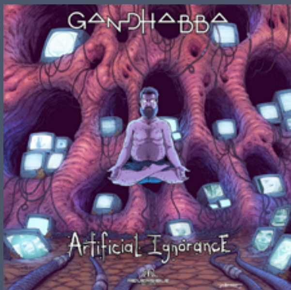
Gandhabba Artificial Ignorance Reversible Rec