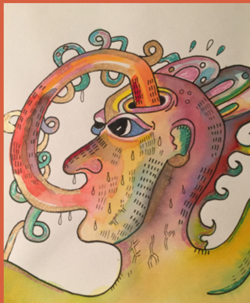
Art & Words by Raja Ram

Now these were early days for synths, but there was shop in Denmark Street, Rod Argent had a shop there, and