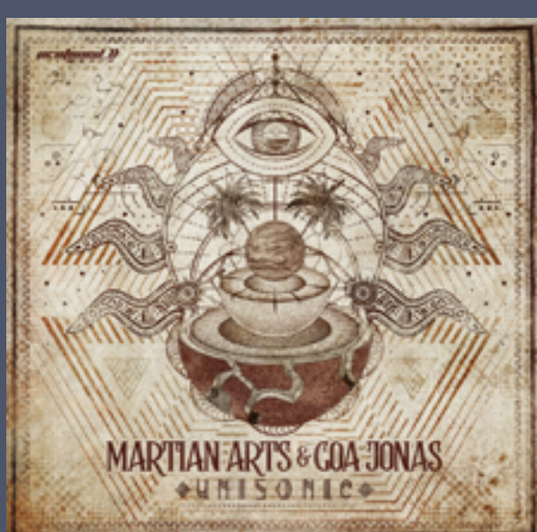
Martian Arts & Goa Jonas Unisonic Protoned Music