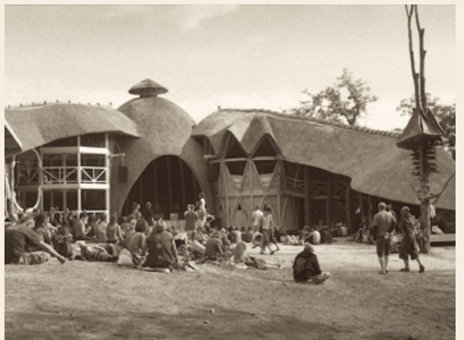
"So much emoción! This photo was taken on the first day of the Dragon's first year."/> /Bodoo/