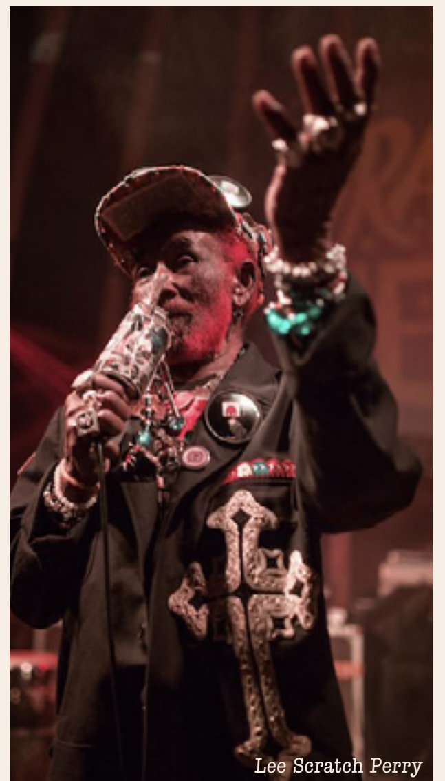
Lee Scratch Perry