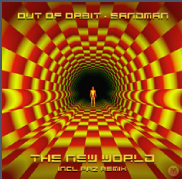
Out of Orbit & Sandman The New World Future Music Rec