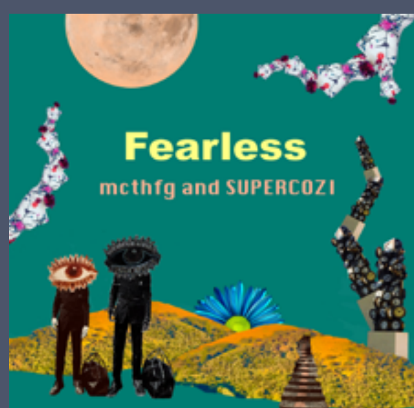
mcthfg and Supercozi Fearless Dubmission Rec