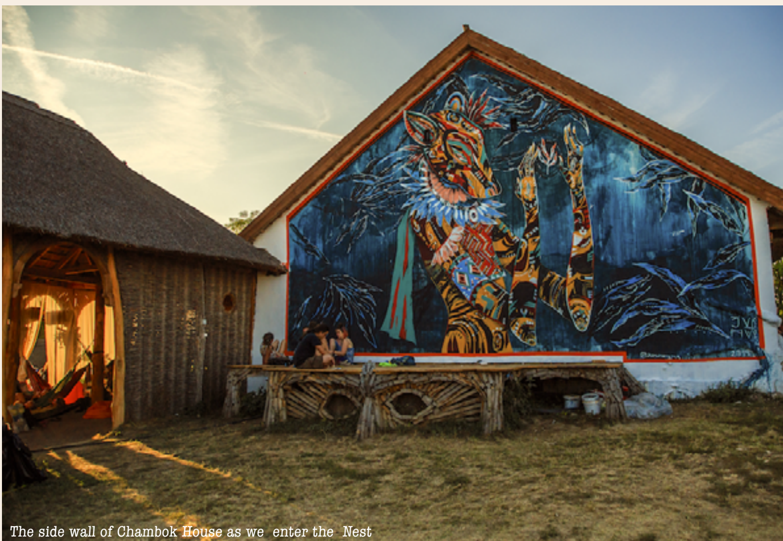
The side wall of Chambok House as we enter the Nest