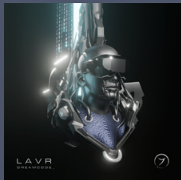
Lavr Dreamcode Zenon Rec