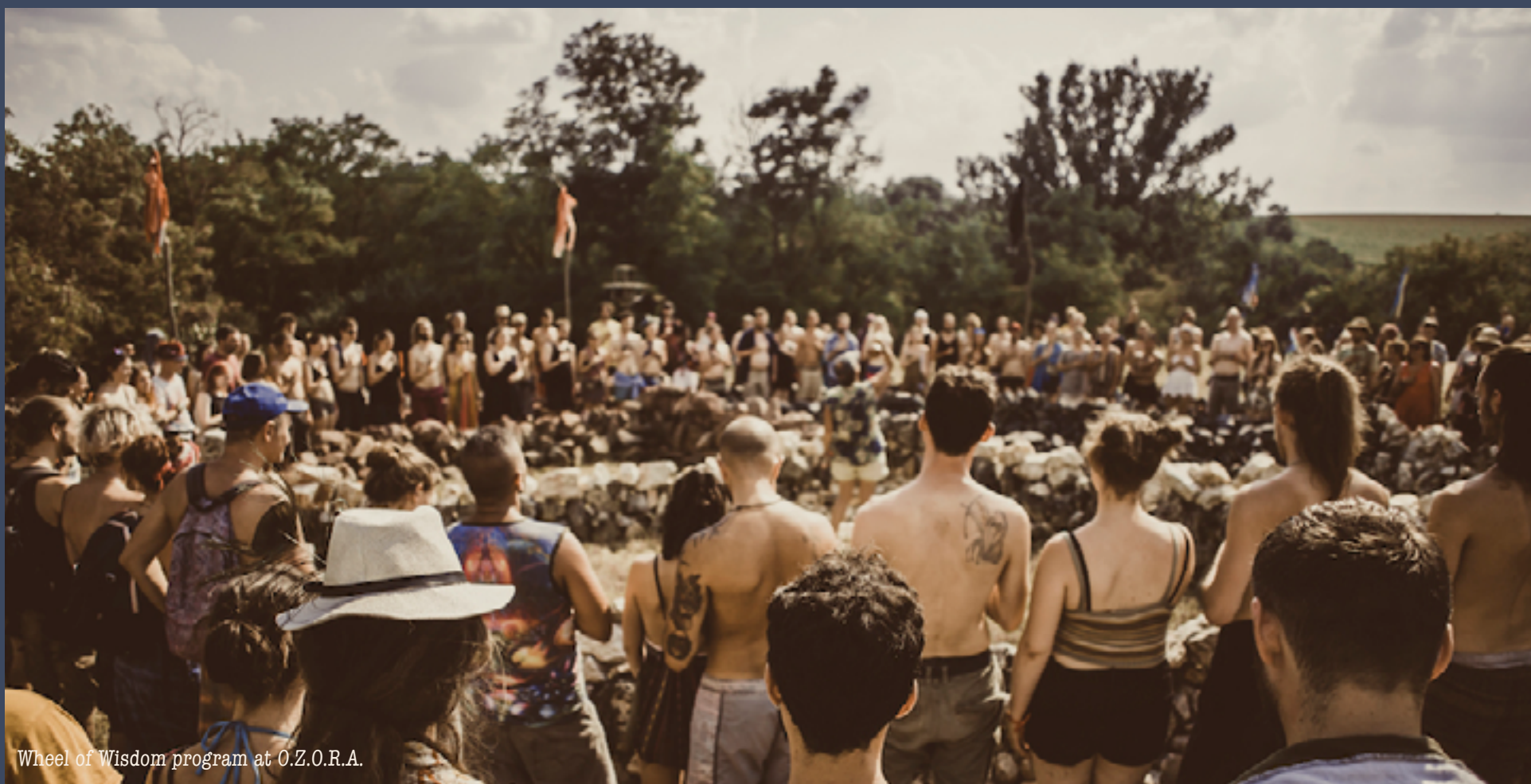
Wheel of Wisdom program at O.Z.O.R.A.