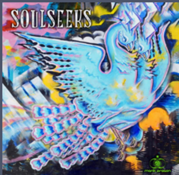
Manic Dragon V/A Soulseekers Manic Dragon Rec