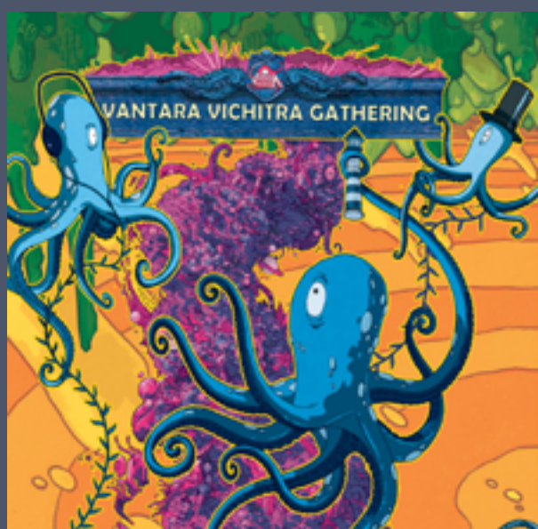
V/A Comp by Alien Trancesistor Vantara Vichitra Gathering Vantara Vichitra Rec