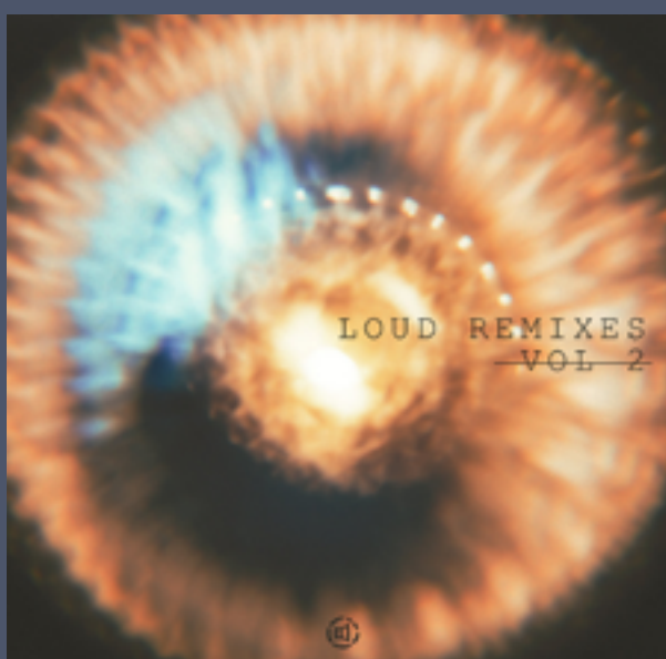
Loud Loud Remixes Vol. 2 Iboga Rec

“For me, this song has always looked forward, and while we must deal with and correct the errors of the past, we can only do that by going forward.