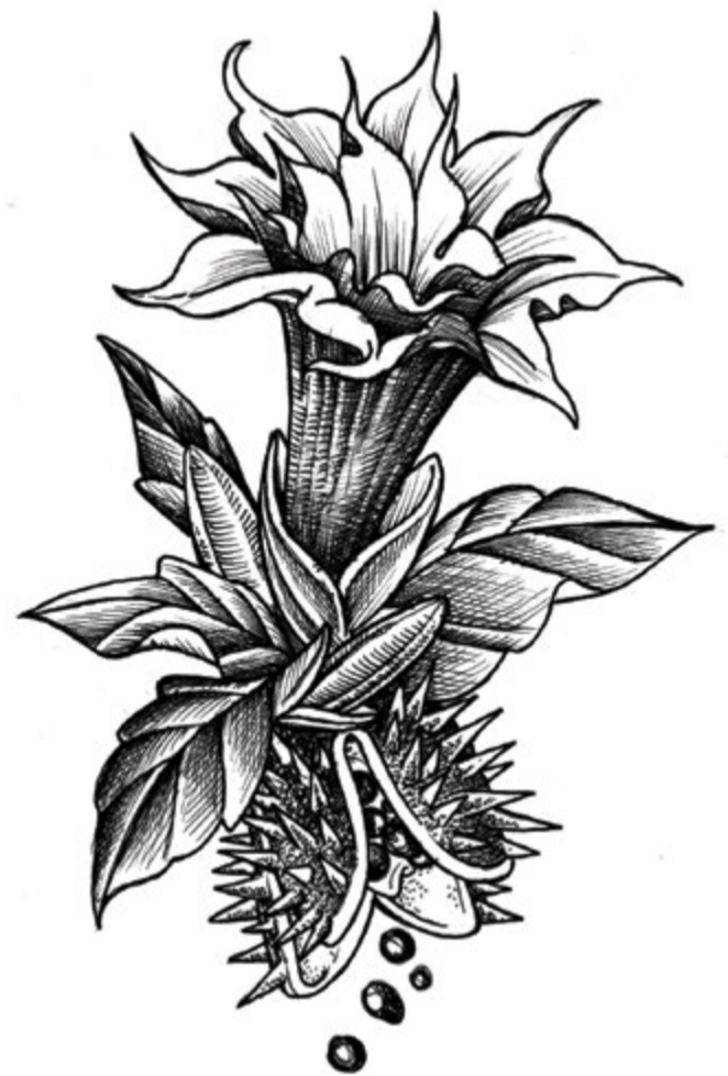
Graphics by: Subliquida